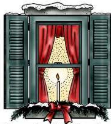
Remember Our Homebound