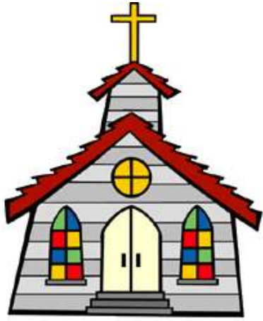
Holy Cross Lutheran Church Voters' Meeting